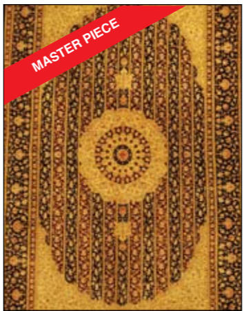
37. Superfine Qum Silk on silk base, 98 x 160cm RM31,000 BEST BUY RM9,999