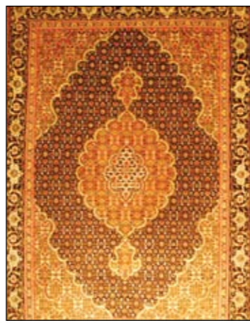
20. Fine Tabriz Wool & silk on cotton base, 103 x 147cm RM14,800 NOW RM4,200