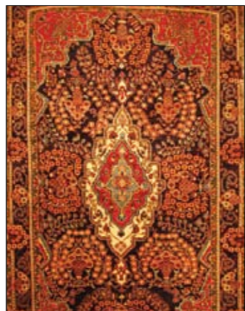
29. Afshar Wool on cotton base, 130 x 210cm RM14,000 NOW RM3,999