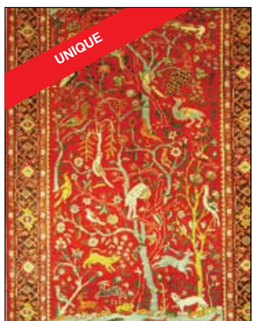
44. Old Bakhtiar Wool on cotton base, 135 x 208cm RM25,000 NOW RM7,500