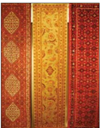
42. Runner (City, Village & Tribal) Many choices in different sizes