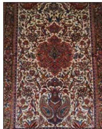
16. Fine Sarukh Wool on cotton base, 130 x 203cm RM18,000 BEST BUY RM5,400