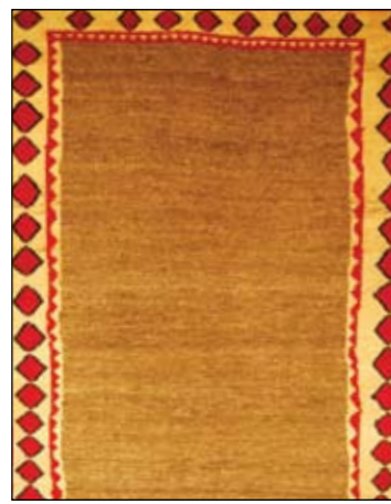
3. Gabbeh Wool on wool base, 125 x 225cm RM17,000 NOW RM999