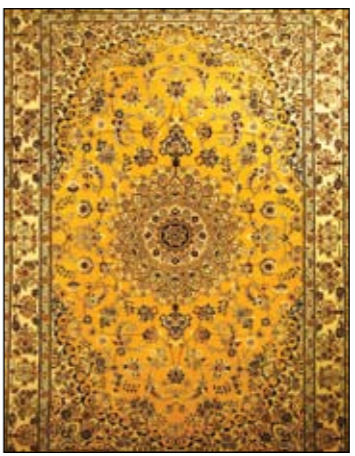
34. Superfine Nain Wool & silk on cotton base, 136 x 202cm BEST BUY!!!