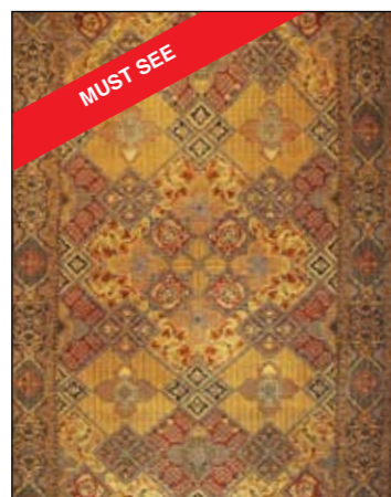
11. Fine Nain Wool & silk on cotton base, 200 x 325cm BEST BUY!!!