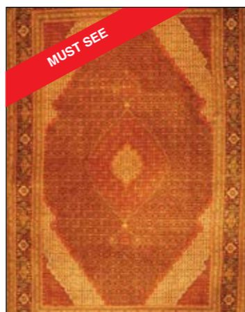
28. Superfine Tabriz (70 Raj) Wool & silk on wool base, 207 x 312cm BEST BUY!!!