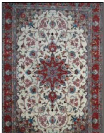
30. Tabriz Wool & Silk on Cotton Base, 161 x 242cm BEST BUY!!!