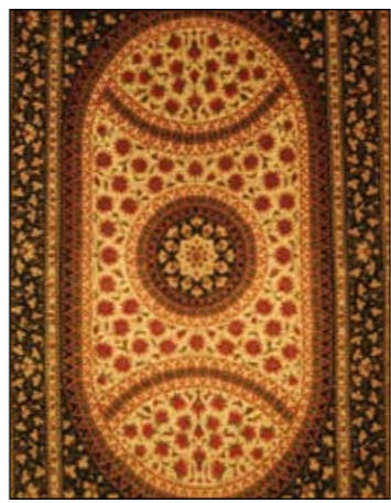
19. Superfine Saveh Wool on cotton base, 145 x 218cm BEST BUY!!!