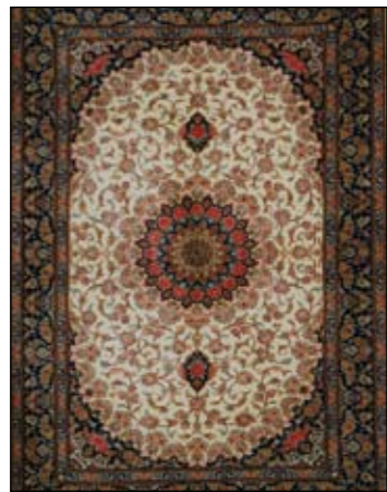
6. Superfine Qum Silk Silk on silk base, 145 x 200cm BEST BUY!!!