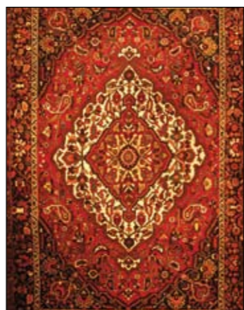
25. Bakhtiar Wool on wool base, 212 x 318cm RM9,000 NOW RM2,900