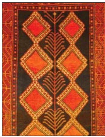
1. Shiraz Wool on wool base, 135 x 265cm RM4,800 NOW RM1,200