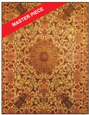
18. Superfine Isfahan, signed by Master Weaver, Kurk wool & silk on silk base, 165 x 243cm BEST BUY!!!