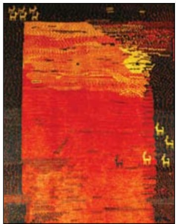
40. Gabbeh Wool on wool base, 103 x 155cm RM4,500 BEST BUY RM1,200