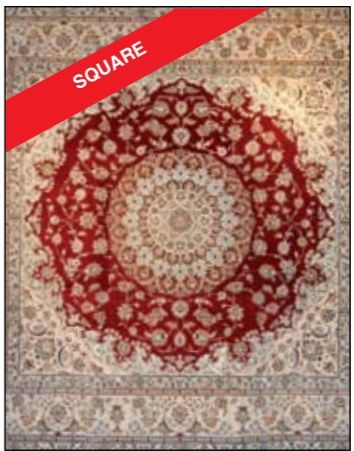
39. Superfine Nain Wool & silk on cotton base, 203 x 205cm RM31,500 BEST BUY RM9,999