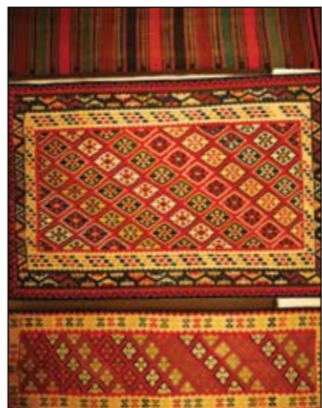
31. Shiraz Kilim, Kordish Kilim Many choices in different sizes