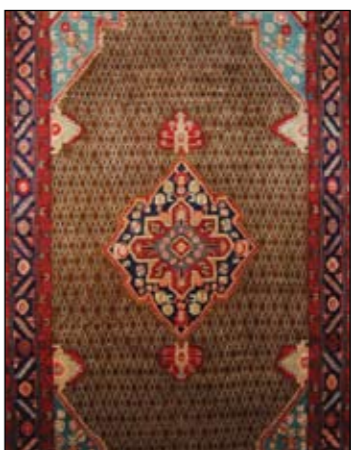
43. Koliaei Wool on cotton base, 150 x 275cm RM6,500 BEST BUY RM1,600