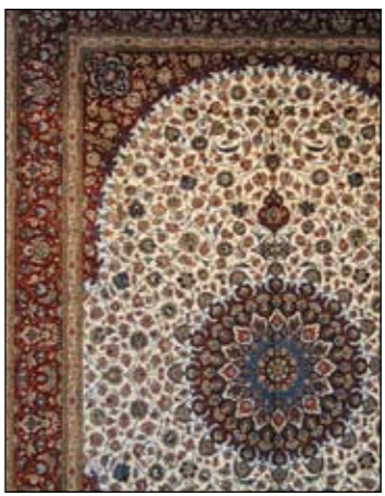
35. Superfine Qum Silk, sign by Master Weaver, Silk on silk base, 198 x 291cm BEST BUY!!!