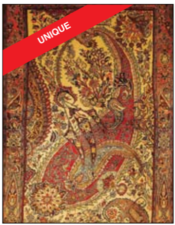
33. Sarukh Wool on cotton base, 135 x 203cm RM18,500 BEST BUY RM5,400