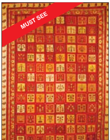
46. Shahsavand Wool on wool base, 200 x 300cm BEST BUY!!!