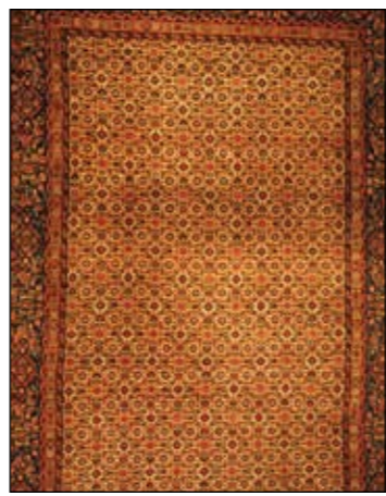
17. Birjand Wool on cotton base, 220 x 316cm RM16,800 NOW RM4,500