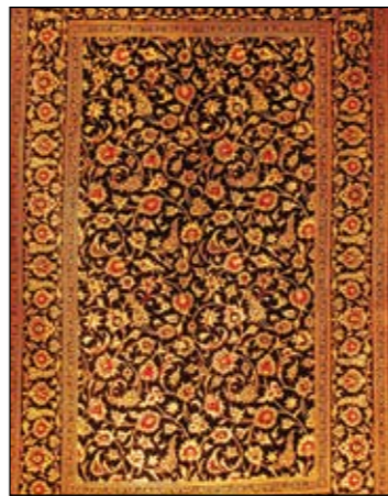
24. Superfine Qum Silk Silk on silk base, 98 x 148cm BEST BUY!!!