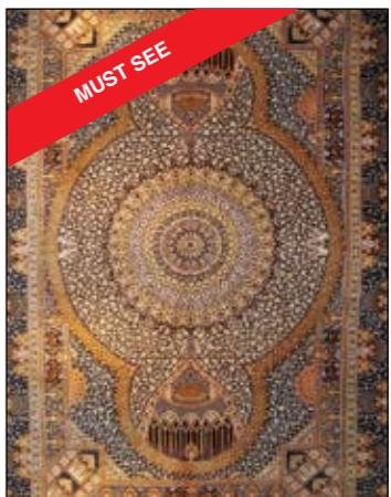
47. Superfine Qum, sign by master weaver Silk on silk base, 198 x 295cm BEST BUY!!!