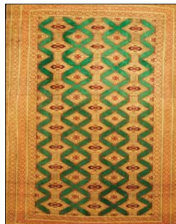
15. Superfine Turkoman Wool on wool base, 135 x 185cm RM7,000 NOW RM1,625