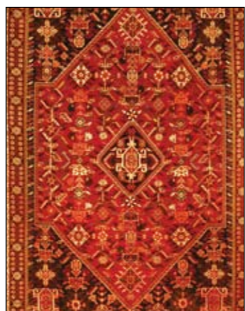
27. Qashqaei Wool & wool base, 105 x 156cm RM11,000 BEST BUY RM3,500