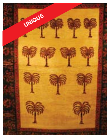
10. Qashqaei Gabbeh Wool on wool base, 236 x 306cm BEST BUY!!!