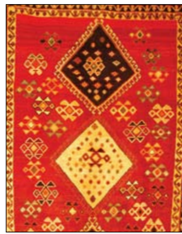
4. Shiraz Wool on wool base, 135 x 236cm RM4,800 NOW RM1,200