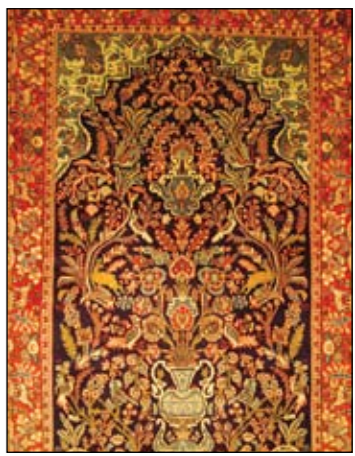
36. Sarukh Wool on cotton base, 135 x 200cm BEST BUY RM4,200