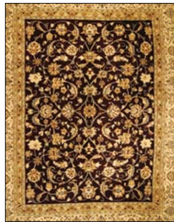
7. Nain Wool & silk on cotton base, 196 x 252cm RM21,000 NOW RM5,250