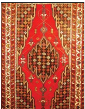
41. 50 Year Old Malayer Wool on cotton base, 139 x 210cm RM9,500 NOW RM2,375