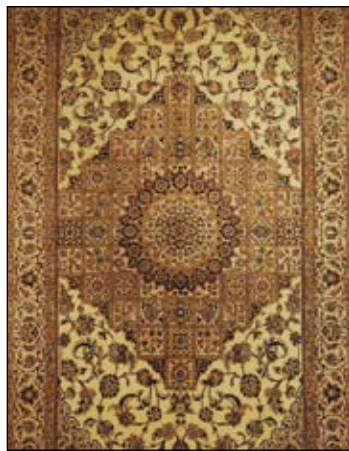
5. Superfine Nain Wool & silk on cotton base, 148 x 231cm BEST BUY!!!