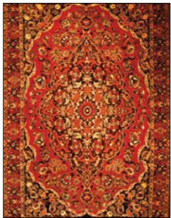
22. Bakhtiar (Bebe Baf) Wool on cotton base, 210 x 325cm BEST BUY RM3,750