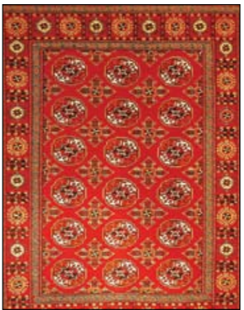
38. Turkoman Wool on cotton base, 120 x 180cm RM4,500 BEST BUY RM1,250