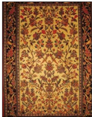
23. Qum Wool on cotton base, 140 x 215cm BEST BUY RM6,800