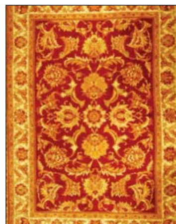
12. Superfine Tabriz Wool & silk on cotton base, 200 x 300cm BEST BUY!!!