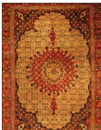
9. Birjand Wool on cotton base, 212 x 315cm RM12,000 NOW RM2,999