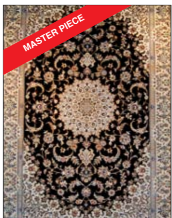
26. Superfine Nain Wool & silk on cotton base, 160 x 240cm BEST BUY!!!