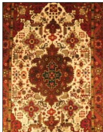
32. Tabriz Wool on cotton base, 100 x 165cm RM12,000 NOW RM2,999