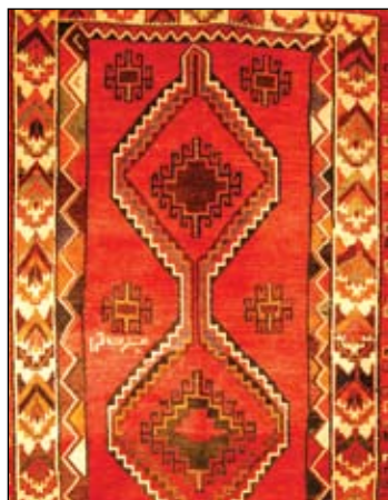
13. 50 Years Old Meshkin Wool on wool base, 148 x 297cm BEST BUY RM1,750