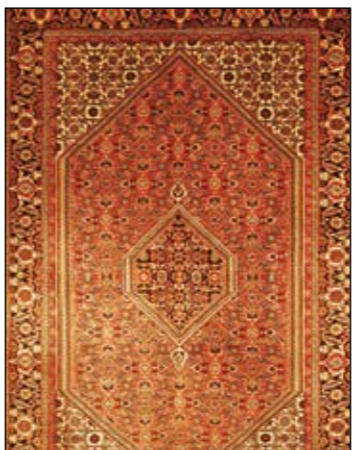
45. Bijar Wool on cotton base, 150 x 200cm RM14,000 BEST BUY RM3,999