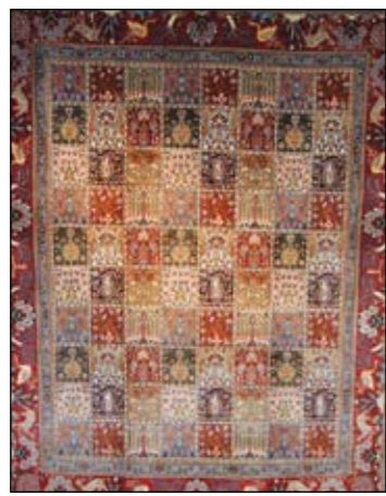
2. Birjand Wool on cotton base, 200 x 250cm RM14,200 NOW RM3,999