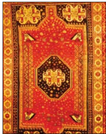
21. Old Shiraz Wool on wool base, 165 x 250cm RM7,000 NOW RM1,750