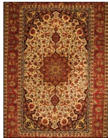
8. Superfine Isfahan, signed by Master Weaver, Wool & silk on silk base, 200 x 300cm BEST BUY!!!