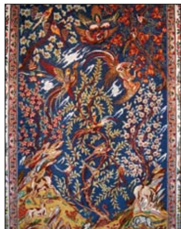
14. Superfine Isfahan Wool & silk on silk base, 110 x 171cm BEST BUY!!!